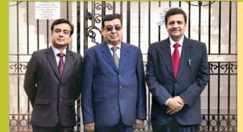
The Visionaries of OmDayal Group