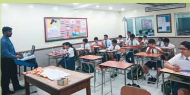
Eastern Vocal Music Class