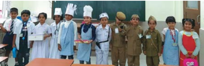
Rolle Play - Doctors' Week