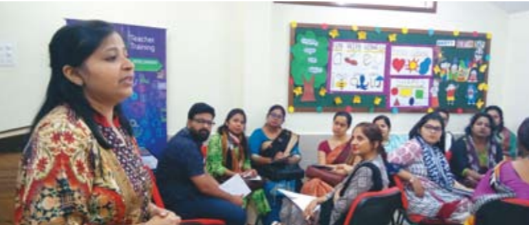
Oxford University Press Workshop for Teachers