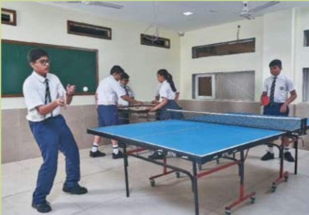
Table Tennis Class