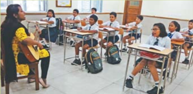
Western Vocal Music Class