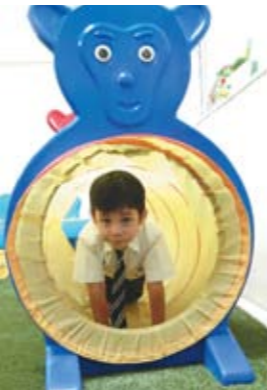
Pre-Primary children in the Activity room