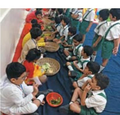
Green Grocery Market